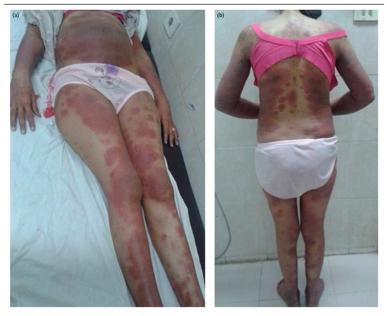
(a) The anterior view of a 21-year-old woman with Stevens–Johnson syndrome. (b) The posterior view of a 21-year-old woman with Stevens–Johnson syndrome.

All patients received systemic steroids at a dose of 0.5 mg/kg and antibiotics (macrolides).