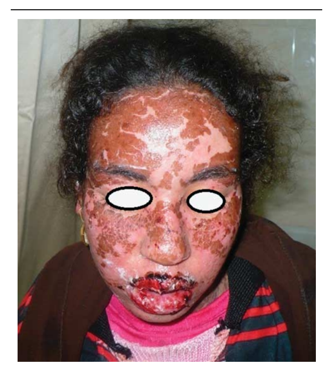
Affection of the oral mucous membrane and the face of a 20-year-old woman with toxic epidermal necrolysis.

avoided in the B*1502 carrier and caution should also be exercised for lamotrigine.