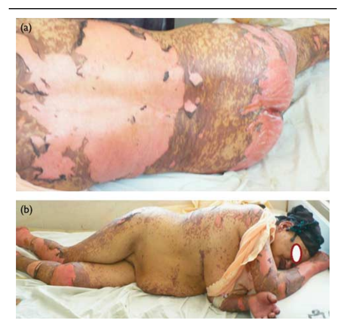
(a) The posterior view of a 56-year-old woman with toxic epidermal necrolysis. (b) The anterior view of a 56-year-old woman with toxic epidermal necrolysis.

Anemia was found in 10 (47.6%) patients [five of 14 (35.7%) with SJS, two of three (66.6%) with SJS/TEN overlap, and three of four (75%) with TEN]. Erythrocyte sedimentation rate (first and second hours) was elevated in all patients. White blood cell and platelet counts were normal in all patients. Liver and renal function tests at the time of admission were normal in all patients. However, during hospital stay, liver function abnormality was observed in about 38% of the patients (8/21).